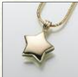
#133GV Small Star - $160 #133SS Small Star - $140 ** #133YG Small Star - Call 3/4"W x 3/4"H