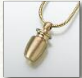
#115 Brass Small Urn - $90 #115SS Small Urn - $150 ** #115YG Small Urn - Call 7/16"W x 11/16"H