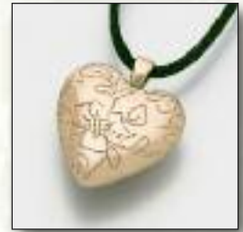
#149BR Floral Heart - $110 15/16"W x 15/16"H