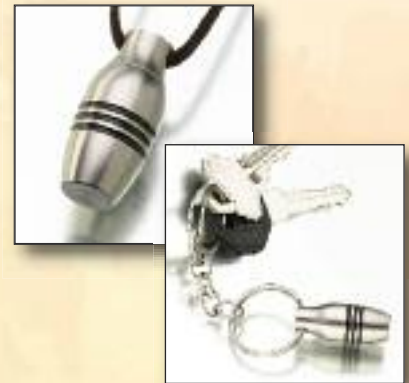
#193ST Urn Pendant w/ Key Chain and 35"L suede leather cording - $150 9/16"W x 1-13/16"H

Sliding double screwed back panel for easy filling. Beveled edge on sides of pendant.