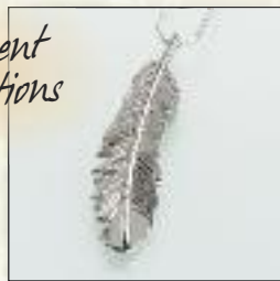
#227SS Sterling Silver Feather - $200 #227YG 14K Yellow Gold Feather - Call 9/16"W x 1-1/2"H x 1/4"D