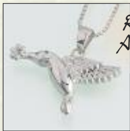
#110SS Sterling Silver Flat Hummingbird w/ Flower - $140 #110YG 14K Yellow Gold Flat Hummingbird w/ Flower - Call 1-1/4"W x 5/8"H x 1/4"D