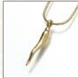
#186GV Italian Horn - $160 #186SS Italian Horn - $140 ** #186YG Italian Horn - Call 3/16"W x 1-1/8"H