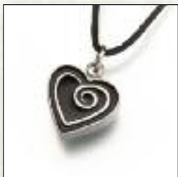
187PT-B Enameled Pewter Satin Finish Black Heart - $90 11/16"W x 11/16"H