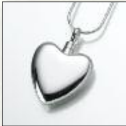
#106GV Large Heart - $230 #106SS Large Heart - $210 **106YG Large Heart - Special Order 1-5/16"W x 1-5/16"H