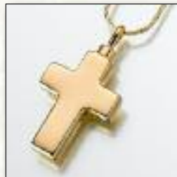
#101GV Large Cross - $220 #101SS Large Cross - $190 **101YG Large Cross - Special Order 1-1/16"W x 1-1/2"H