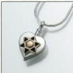
#119SK Heart w/ Star of David Inset - $350 #119SS Star of David Heart- $160 ** #119YG Star of David Heart - Call 13/16"W x 13/16"H