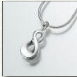
#171GV Infinity - $200 #171SS Infinity - $180 ** #171YG Infinity - Call 1 1/2"W x 7/8"H