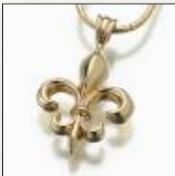
#192GV Fleur de Lis - $180 #192SS Fleur de Lis - $160 ** #192YG Fleur de Lis - Call 7/8"W x 1" H x 1/4" D