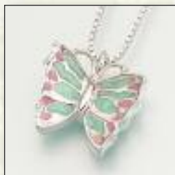
#129SS Butterfly - $220 13/16"W x 11/16"H