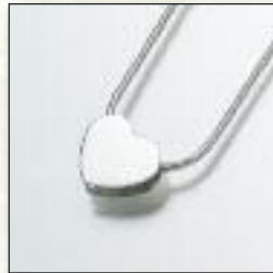
#130GV Sliding Heart - $150 #130SS Sliding Heart - $140 **#130YG Sliding Heart - Call 5/8"W x 5/8"H x 3/16"D Double Chamber Option Available