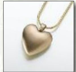
#111BR Satin Finish Heart - $90 15/16"W x 15/16"H