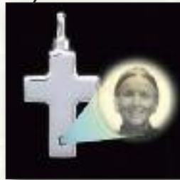
#151SS Large Cross w/ Lens - $450 1-1/16"W x 1-1/2"H

Hand-crafted lens magnifies image 160 times