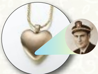
#150BR Heart w/ Lens - $350 15/16"W x 15/16"H

Hand-crafted lens magnifies image 160 times