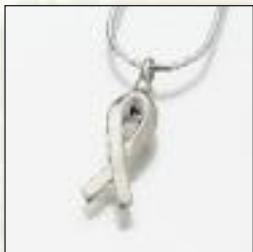
#195GV Remembrance Ribbon - $170 #195SS Remembrance Ribbon - $150 ** #195YG Remembrance Ribbon - Call 7/16"W x 1"H x 3/16" D