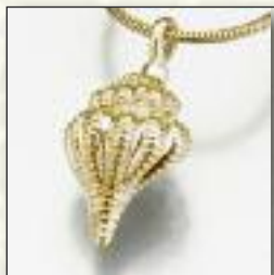
#197GV Conch Shell - $170 #197SS Conch Shell - $150 **#197YG Conch Shell - Call 5/8"W x 3/4"H