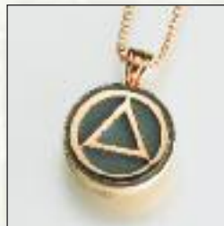
#204GV Serenity - $200 #204SS Serenity - $180 #204YG Serenity - Call 3/4"Diameter x 1/4" Deep