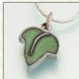
#188PT Enamelled Pewter Satin Finish Green Leaf - $90 5/8"W x 11/16"H