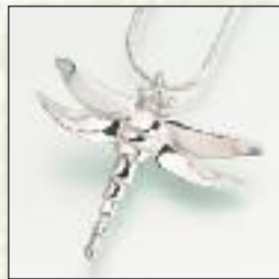
#163GV Dragonfly - $190 #163SS Dragonfly - $160 ** #163YG Dragonfly - Call 1-5/8"W x 1-1/4"H x 5/16"D