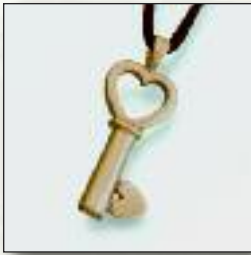
#218BR Satin Finish Key to My Heart - $110 #218WB Satin Finish Key to My Heart - $110 5/8"W x 1-1/4"H

All items pictured not actual size. Measurements do not include the bales. All chains and leather cord sold separately. Satin cord included with all orders.