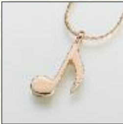
#202GV Music Note - $200 #202SS Music Note - $192 ** #202YG Music Note - Call 3/16"W x 1-3/8"H