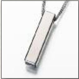
#136TT Long Narrow Sliding Rectangle - $320 5/16"W x 1-5/16"H 24" Titanium Chain Included