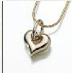
#184GV Puff Heart - $220 #184SS Puff Heart - $200 ** #184YG Puff Heart - Call 13/16"W x 3/4"H