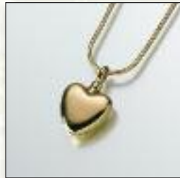
#107GV Small Heart - $180 #107SS Small Heart - $150 ** #107YG Heart - Call 11/16"W x 11/16"H