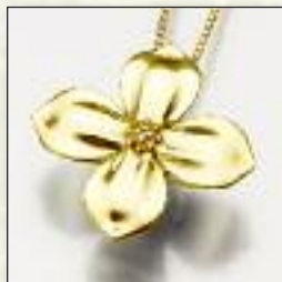
#196GV Dogwood Blossom - $190 #196SS Dogwood Blossom - $170 ** #196YG Dogwood Blossom - Call 1-1/4"W x 1-1/4"H x 3/8"D