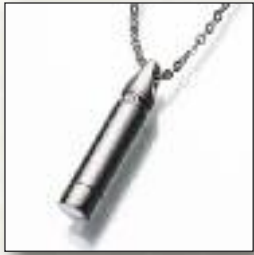
#118TT Cylinder w/ Crystal Chip - $330 5/16"W x 1-5/16"H 24" Titanium Chain Included