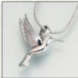
#215SS Hummingbird - $120 ** #215YG Hummingbird - Call 3/4"W x 1"H