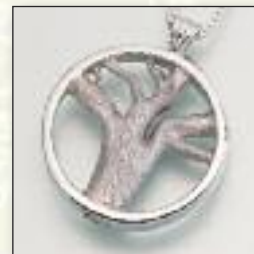
#205SS 4-chamber Tree of Lives - $270 1-1/4" Diameter x 1/4" Deep Not available in Gold Vermeil 14K Special Order - Call