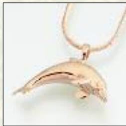
#162GV Dolphin - $190 #162SS Dolphin - $170 **#162YG Dolphin - Call 1-1/8"W x 1/2"H