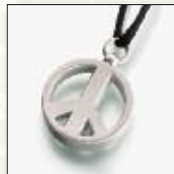
#201PT Peace Sign - $90 15/16"W x 15/16"H