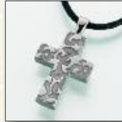
#222PT-A Pewter Cross w/ Antique Filigree - $110 #223PT Pewter Cross w/ Filigree - $110 3/4"W x 11/16"H x 3/16"D