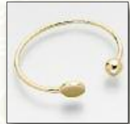
#214SS Bangle Bracelet - $280 #214YG Bangle Bracelet - Call Ball - 1/2" x 5/8"

Smaller-sized pendants can be attached to double-link bracelets. Pendants sold separately.