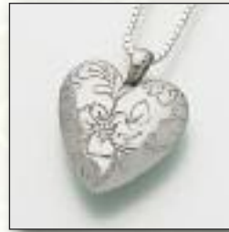
#149WB Floral Heart - $110 15/16"W x 15/16"H