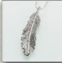
#227SS Sterling Silver Feather - $200 #227YG 14K Yellow Gold Feather - Call 9/16"W x 1-1/2"H x 1/4"D