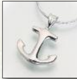
#217SS Anchor - $180 ** #217YG Anchor - Call 13/16"W x 3/4"H