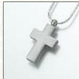
#112PT Satin Finish Cross - $90 7/8"W x 1-1/4"H