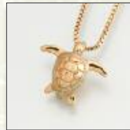
#157GV Turtle - $180 #157SS Turtle - $160 ** #157YG Turtle - Call 3/4"W x 3/4"H