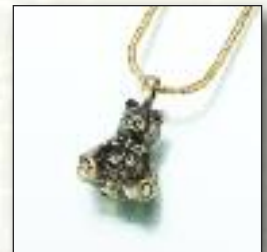
#125BR Antiqued Teddy Bear - $90 #125WB Antiqued Teddy Bear - $90 5/8"W x 3/4"H