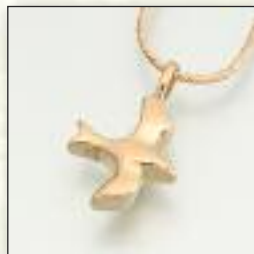
#159GV Dove - $180 #159SS Dove - $160 ** #159YG Dove - Call 5/8"W x 3/4"H