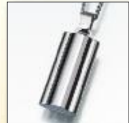
#174ST-N Narrow Flask - $430 1/2"W x 15/16"H 24" Stainless Steel Chain Included