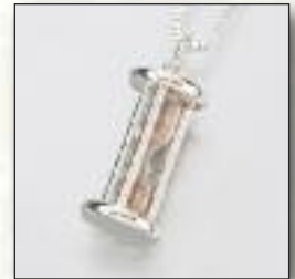
#200SS "Our" Glass - $252 1/2"W x 15/16"H