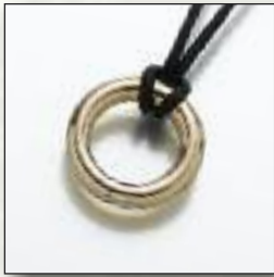
#180GV Eternity - $240 #180SS Eternity - $210 **#180YG Eternity - Call 1" Diameter Circle

All items pictured not actual size. Measurements do not include the bales. All chains and leather cord sold separately. Satin cord included with all orders.