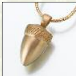
#155BR Acorn - $90 #155SS Acorn - $150 #155GV Acorn - $170 1/2"W x 3/4"H