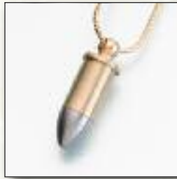
#219BR/WB Bullet - $110 7/16"W x 1-5/16"H