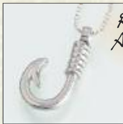
#228SS Sterling Silver Fish Hook - $140 #228YG 14K Yellow Gold Fish Hook - Call 5/8"W x 7/8"H x 1/4"D