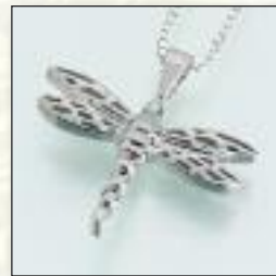
#216SS Small Dragonfly - $130 ** #216YG Small Dragonfly - Call 1"W x 11/16"H