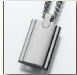
#174ST Flask - $430 1 1/16"W x 1"H 24" Stainless Steel Chain Included