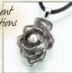
#224PT-A Antique Pewter Rose w/ Pearl - $110 #225PT Pewter Rose w/ Pearl - $110 7/8"W x 1-1/8"H x 3/8"D