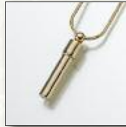
#117BR Cylinder - $90 #117SS Cylinder - $170 ** #117YG Cylinder - Call 1/4"W x 1-1/4"H Double Chamber Option Available