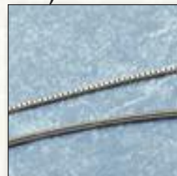
#139SS-18 Box Chain - 18" - $56 #139SS Box Chain - 24" - $70 #139GF-18 Box Chain - 18" - $72