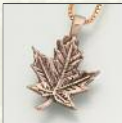
#154BR Antique Maple Leaf - $90 #154SS Maple Leaf - $150 #154GV Maple Leaf - $160 13/16"W x 1"H