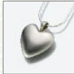
#111WB Heart - $90 15/16"W x 15/16"H