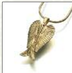
#185GV Angel Wings - $220 #185SS Angel Wings - $200 #185SS-A Antiqued Angel Wings - $200 ** #185YG Angel Wings - Call 13/16"W x 1-3/16"H