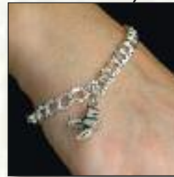
#164SS-B Double Link Bracelet w/ jump ring - $60 7mm links, 7" long (jump rings should be soldered)