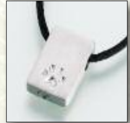
#229SS Sterling Silver Rectangle Pendant w/ Paw Print - $160 #229YG 14K Yellow Gold Rectangle Pendant w/ Paw Print - Call 1/2"W x 3/4"H x 1/4"D