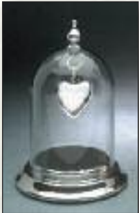
#137PT Blown Glass Dome, Pewter Base - $80 4" round x 6" high (Pendant sold separately)