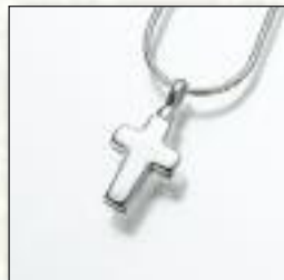
#102GV Small Cross - $170 #102SS Small Cross - $140 ** #102YG Small Cross - Call 9/16"W x 13/16"H