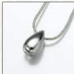
#121GV Slide Tear Drop - $180 #121SS Slide Tear Drop - $160 ** #121YG Slide Tear Drop - Call 7/16"W x 7/8"H