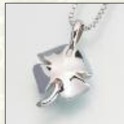
#167GV 4 Leaf Clover - $180 #167SS 4 Leaf Clover - $160 ** #167YG 4 Leaf Clover - Call 5/8"W x 3/4"H