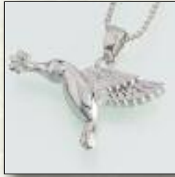
#110SS Sterling Silver Flat Hummingbird w/ Flower - $140 #110YG 14K Yellow Gold Flat Hummingbird w/ Flower - Call 1-1/4"W x 5/8"H x 1/4"D