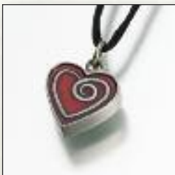
187PT Enameled Pewter Satin Finish Red Heart - $90 11/16"W x 11/16"H