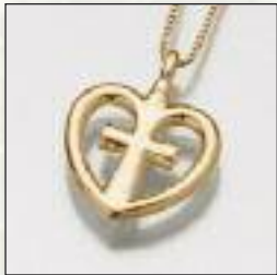
#198GV Love Cross - $190 #198SS Love Cross - $170 ** #198YG Love Cross - Call 1"W x 1"H x 3/16"D