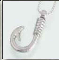
#228SS Sterling Silver Fish Hook - $140 #228YG 14K Yellow Gold Fish Hook - Call 5/8"W x 7/8"H x 1/4"D