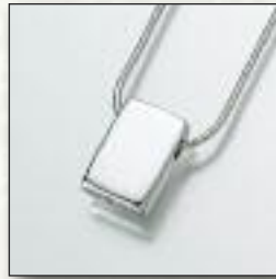
#135GV Slide Rectangle - $180 #135SS Slide Rectangle - $150 ** #135YG Slide Rectangle - Call 1 1/2"W x 3/4"H x 1/4"D