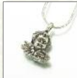
#123BR Antiqued Cherub - $90 #123WB Antiqued Cherub - $90 13/16"W x 3/4"H