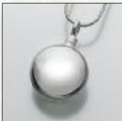
#116SS Large Round - $210 **116YG Large Round - Special Order 1-1/8"W x 1-1/8"H x 1/2"D