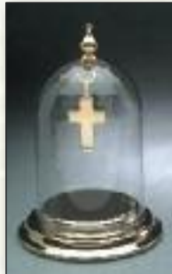
#137GV Blown Glass Dome, Gold Overlay Base - $100 4" round x 6" high (Pendant sold separately)