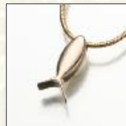
#183GV Fish (Ichthus) - $150 #183SS Fish (Ichthus) - $130 ** #183YG Fish (Ichthus) - Call 3/8"W x 3/4"H

All items pictured not actual size. Measurements do not include the bales. All chains and cording sold separately.