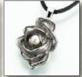
#224PT-A Antique Pewter Rose w/ Pearl - $110 #225PT Pewter Rose w/ Pearl - $110 7/8"W x 1-1/8"H x 3/8"D