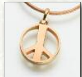
#213GV Peace Sign - $190 #213SS Peace Sign - $160 ** #213YG Peace Sign - Call 3/4"Diameter x 3/16"W