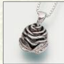
#156SS Rose - $160 **#156YG Rose - Call 5/8"W x 5/8"H