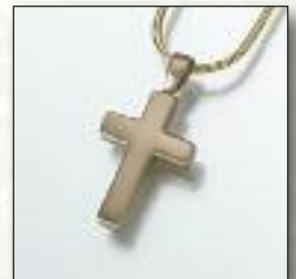
#114 Brass Satin Finish Cross - $90 5/8"W x 1"H