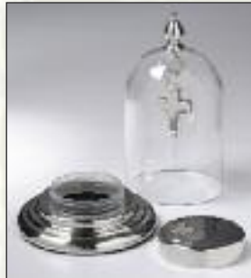
#138GV Fillable Base w/ Glass Dome Top - $150 #138PT Fillable Base w/ Glass Dome Top - $120 4" round x 6" high (Pendant sold separately)