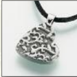
#220PT-A Pewter Heart w/ Antique Filigree - $110 #220PT Pewter Heart w/ Filigree - $110 3/4"W x 3/8"H x 3/16"D